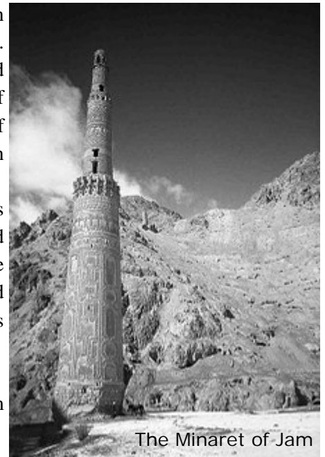
The Minaret of Jam

"... a striding, glorious book. But it's more than great journalism. It's a great travel narrative...He writes with a mystic's appreciation of the natural world, a novelist's sense of character and a comedian's sense of timing."