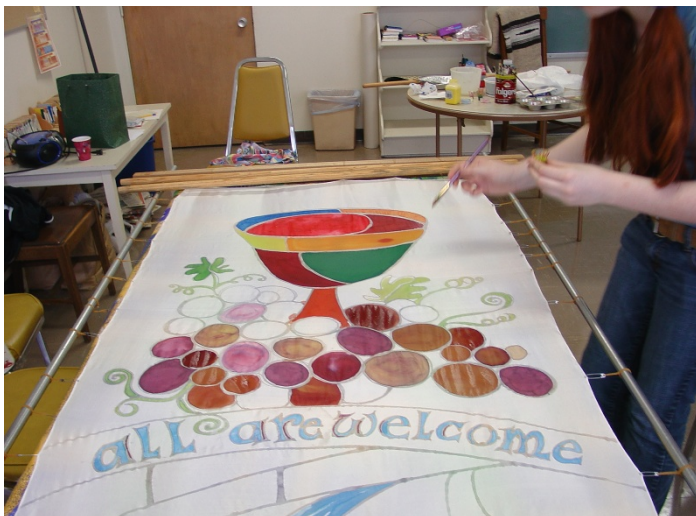
Faith Trek Kids Create Worship Banners (2008)

Come for coffee, bible study, and good conversation. Our Saturday study is the granddaddy of all our small groups. Looking for a good way to kick off your Saturday mornings? Contact Herb Crabtree or the church office for more information.